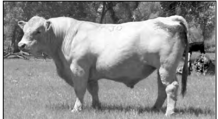
MC LM ALL IN, May 2016

✓ BHSS 2013 Grand Champion bull. Active, athletic range bull that sires the same! Great eye-appeal and soundness!