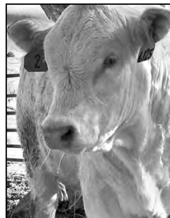
I like his face!