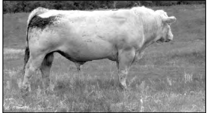
2TM Revelation 120, May 2016

✓ Purchased at 2014 BHSS. Used mostly on young cows and heifers. Very thick, eye-appealing, lower BW calves!